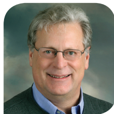
John J. Babcock Rotochopper