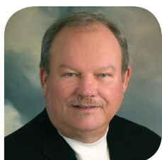
Reggie Clow Clow Stamping