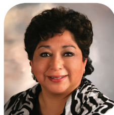
Mayuli Bales Diocese of St. Cloud